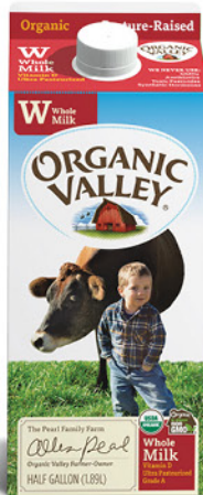
Organic Valley Organic Milk (selected varieties)

The exceptional quality of our food starts with love for our animals. We go all out when caring for our cows, because that makes them happier and healthier. And that makes better milk you can feel good about serving to your family.