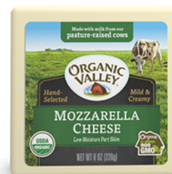
Organic Valley Organic Cheese (selected varieties)