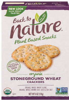
Back to Nature Crackers (selected varieties)