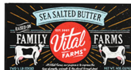
Vital Farms Butter