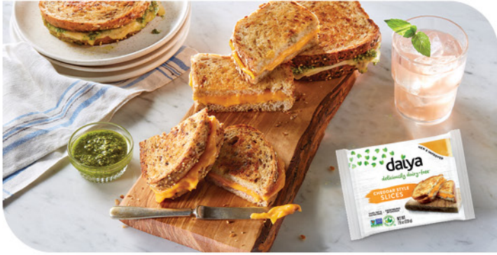
Daiya Dairy-Free Slices (selected varieties)