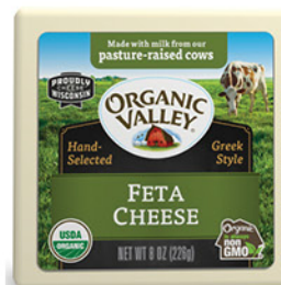
Organic Valley Organic Feta Cheese