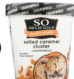
So Delicious Cashewmilk Frozen Dessert (selected varieties)