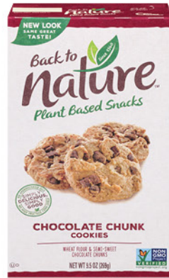
Back to Nature Chocolate Chunk Cookies

Back to Nature's Plant Based foods give people truly delicious foods made from recipes inspired by nature. Our cookies and crackers are uncomplicated and deliciously simple. We hope you enjoy.