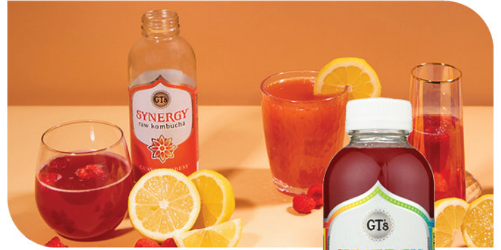
GT's Organic Kombucha (selected varieties)